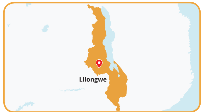
Program Office Location Lilongwe, Malawi

In 2015, to serve 2,461 children in Malawi, ZOE invested: