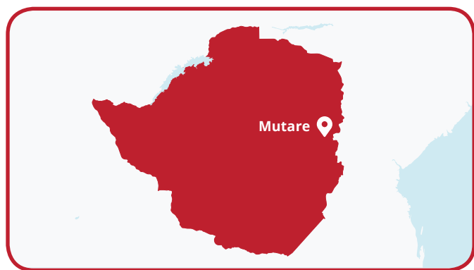
Program Office Location Mutare, Zimbabwe

In 2015, to serve 3,174 children in Zimbabwe, ZOE invested: