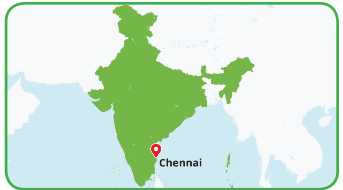
Program Office Location Chennai, South India

In 2015, to serve 1,152 children in India, ZOE invested: