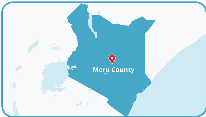
Program Office Location Meru County, Kenya

In 2015, to serve 10,663 children in Kenya, ZOE invested: