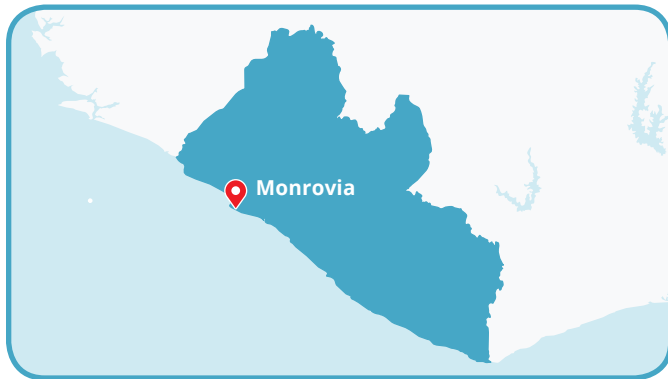
Program Office Location Monrovia, Liberia

In 2015, to serve 1,140 children in Liberia, ZOE invested: