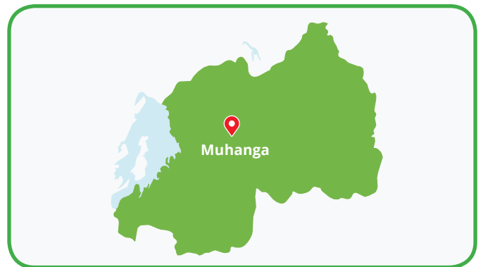
Program Office Location Muhanga Town, Rwanda

In 2015, to serve 9,505 children in Rwanda, ZOE invested: